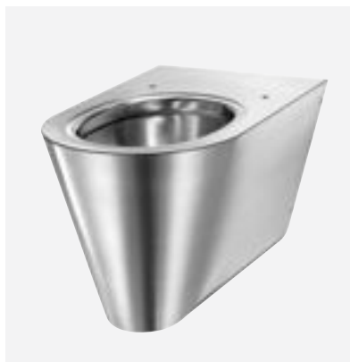
S21 S wall-hung stainless steel designer WC Ref. DELABIE: 110310

Images available on our website delabie.co.uk , in the PRESS section