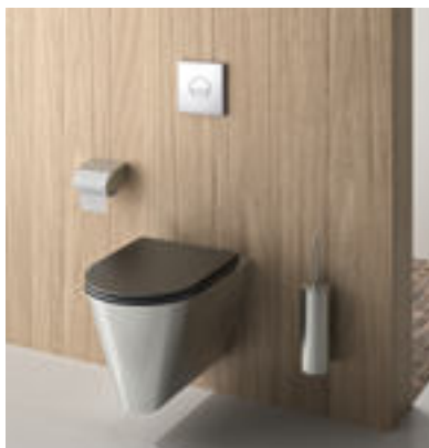
S21 S wall-hung stainless steel designer WC installation example