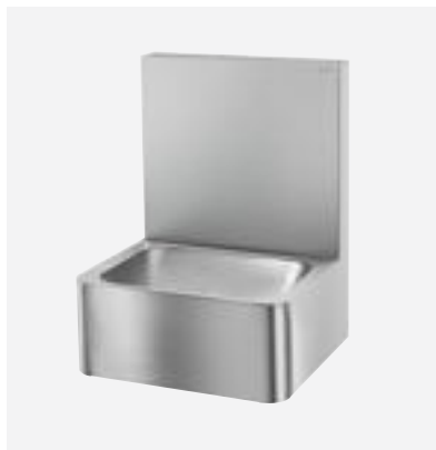
Hygiene washbasin in stainless steel Ref. DELABIE: 188000

Images available on our website delabie.co.uk , in the PRESS section