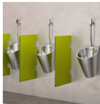
FINO stainless steel urinal installation example