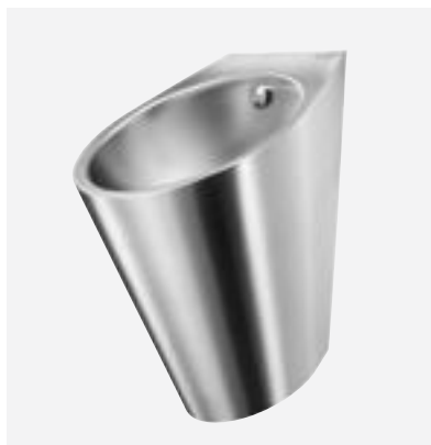
FINO stainless steel designer urinal Ref. DELABIE: 135710

Images available on our website delabie.co.uk , in the PRESS section