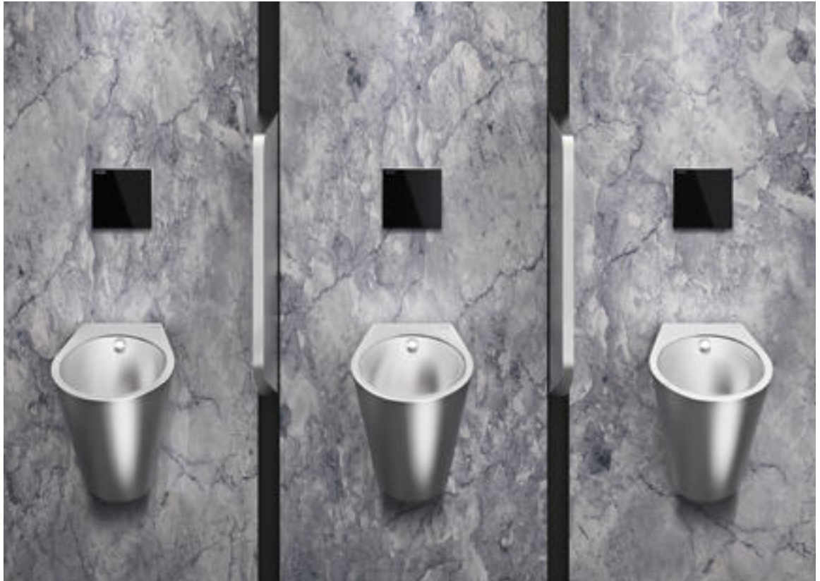
Ref. DELABIE: 135710

Industrial? Stainless steel? Think again! DELABIE combines expertise and creativity to reshape and reinterpret stainless steel.