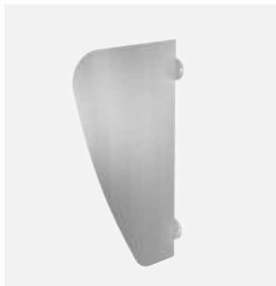
AZA urinal divider Ref. DELABIE: 100620

Images available on our website delabie.co.uk , in the PRESS section