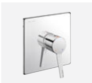
Recessed mechanical shower mixer Ref. DELABIE: 2541 + 254BOX