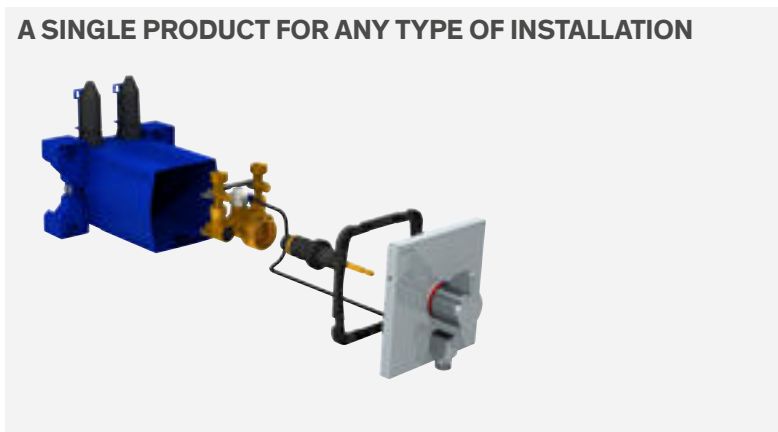
Recessed shower mixer Ref. DELABIE: H96CBOX + H9633