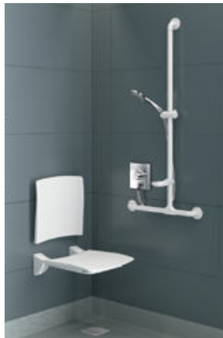
Lifestyle image: shower with H9633 mixer Ref. DELABIE: DOUCHE HÉBERGEMENT H9633