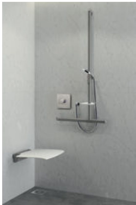
Lifestyle image: shower with H9631 mixer Ref. DELABIE: DOUCHE H9631