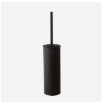
Toilet brush set with lid