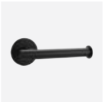
Toilet roll holder, or for spares