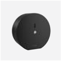
Toilet paper dispenser