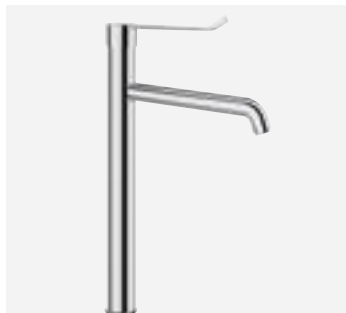
Mechanical sink mixer with swivelling spout Ref. DELABIE: 2564T4