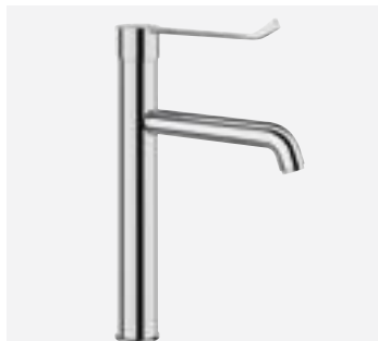
Mechanical basin mixer with pressure balancing and fixed spout Ref. DELABIE: 2565T5EP

Images available on our website delabie.co.uk , in the PRESS section