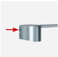
Thermal shock feature