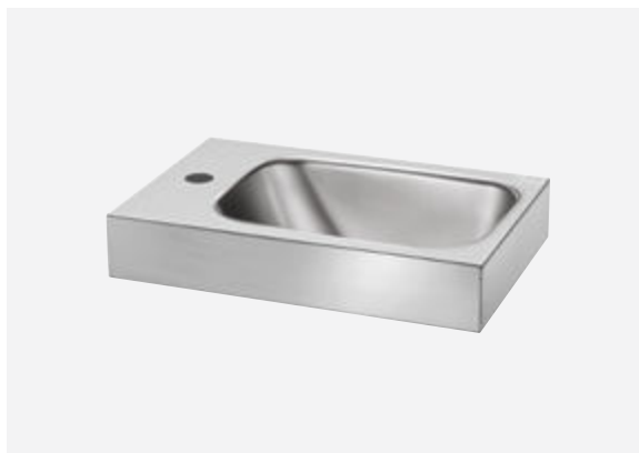
LAVANDO WC hand washbasin Ref. DELABIE: 121360

Images available on our website delabie.co.uk , in the PRESS section