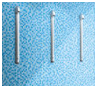
Installation example: SPORTING 2 SECURITHERM electronic shower panels Ref. 714916