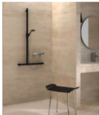
Installation example: Be-Line® black T-shaped grab bar Ref. DELABIE 511944BK