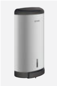
Soap dispenser specifically designed for showers