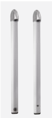
Creates a design DUO with the SPORTING 2 time flow or electronic shower panels