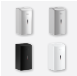
Design: available in 4 finishes