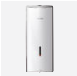
Electronic liquid soap dispenser