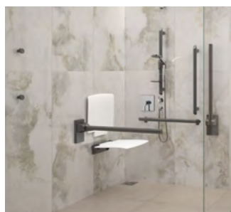
Installation example: Recessed thermostatic sequential shower mixer Ref. H96BOX-H9631L

Running for 25 years, the Building Better Healthcare Awards are designed to recognise and reward the best innovations within the healthcare built environment, medical device and technology sectors. A panel of 12 judges evaluate the entries against a rigorous set of criteria, and they ultimately select the winners for each category – estates and facilities management, building design, patient environment, and technology. Winners ranged from new hospital developments to community-based facilities, and from innovative healthcare technologies to art projects.