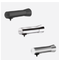
Design: available in 3 finishes