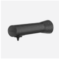
Electronic liquid soap or hydroalcoholic gel dispenser

New matte black electronic soap dispenser